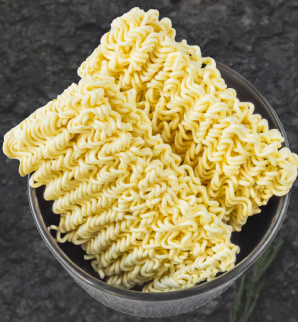
★ KOREAN RAMEN $2.00 full portion