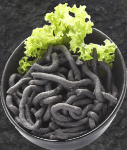
FISH NOODLES $6.00 full portion