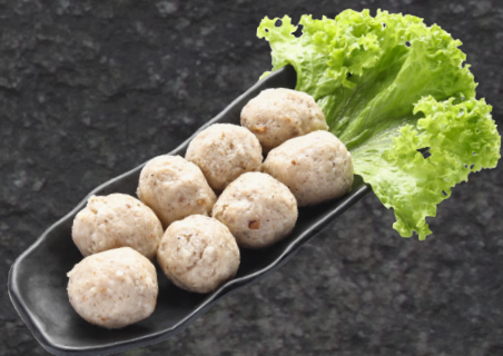
MUSHROOM BALL $5.00 half portion (4 pcs) $10.00 full portion (8 pcs)