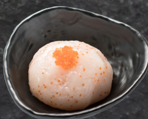
★ EBIKO PRAWN PASTE $10.00 full portion