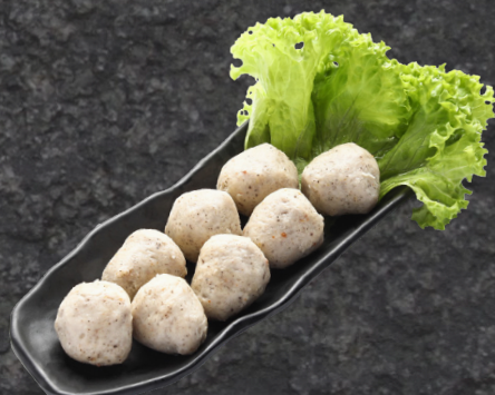
BLACK PEPPER PORK MEAT BALL $5.00 half portion (4 pcs) $10.00 full portion (8 pcs)