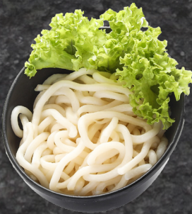
UDON $3.00 full portion