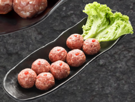
★ BEEF MEAT BALL $5.00 half portion (4 pcs) $10.00 full portion (8 pcs)