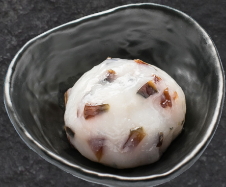
★ CENTURY EGG FISH PASTE $10.00 full portion