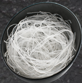
TANG HOON $3.00 full portion