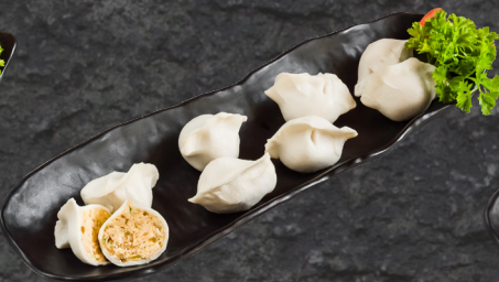
CABBAGE PORK DUMPLING $4.00 half portion $8.00 full portion