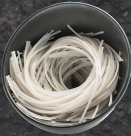
SWEET POTATO NOODLES $2.00 full portion