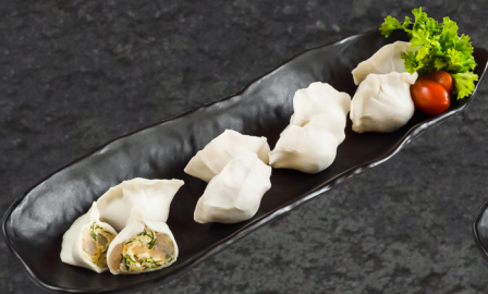
SEAFOOD DUMPLING $4.00 half portion $8.00 full portion