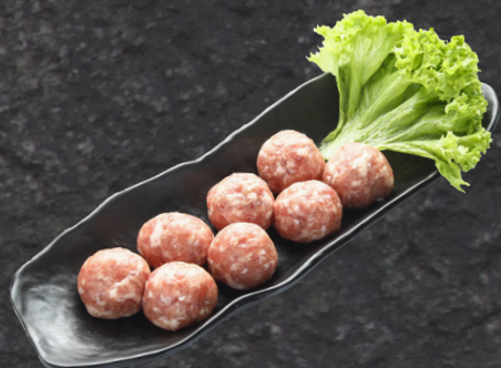
★ PORK MEAT BALL $4.00 half portion (4 pcs) $8.00 full portion (8 pcs)