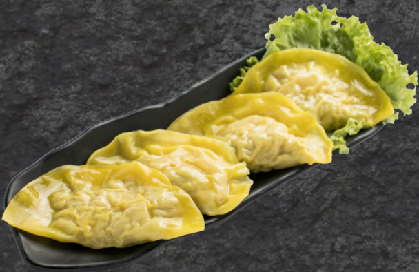
★ PRAWN DUMPLING $4.00 half portion $8.00 full portion