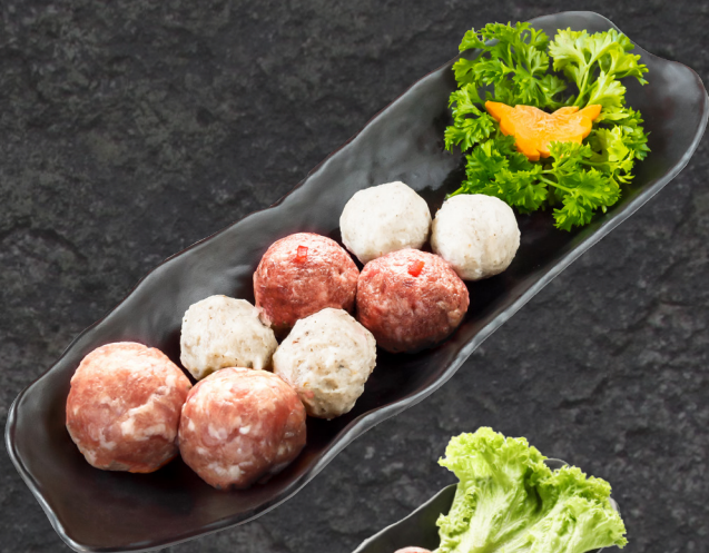
★ ASSORTED MEAT BALL COMBO $11.00 full portion (8 pcs)