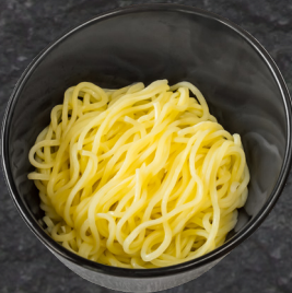
LA MIA★ $3.00 full portion