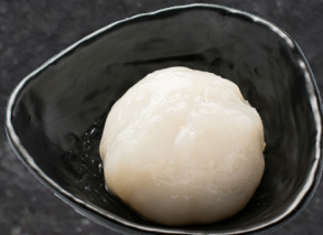
HOMEMADE FISH PASTE $8.00 full portion