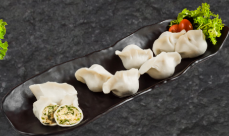
CHIVE PORK DUMPLING $4.00 half portion $8.00 full portion