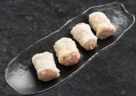
FISH MAW WITH PORK & FISH PASTE $12.00 full portion